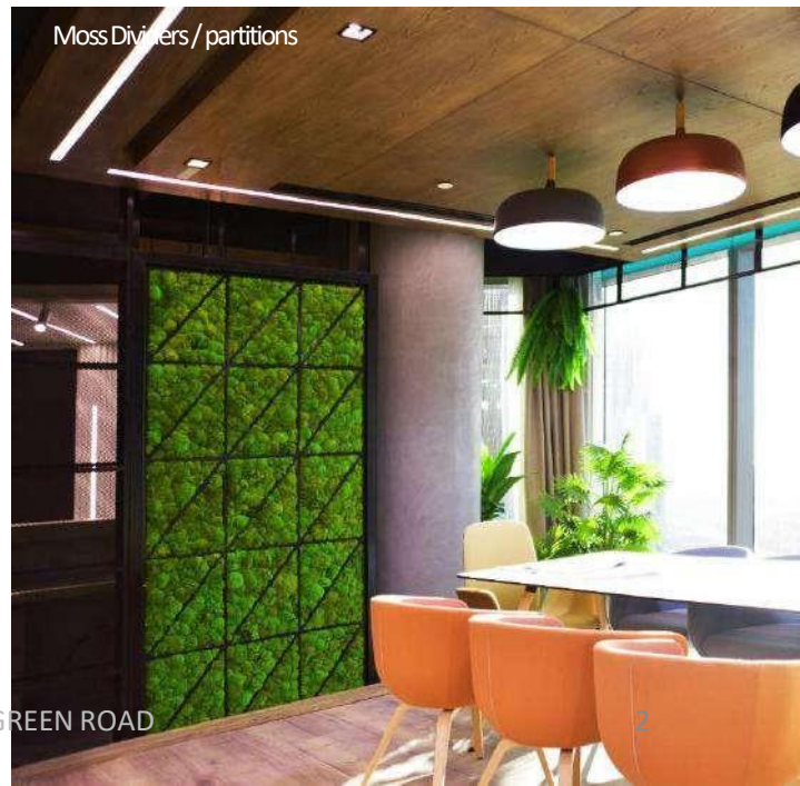
Moss Dividers / partitions