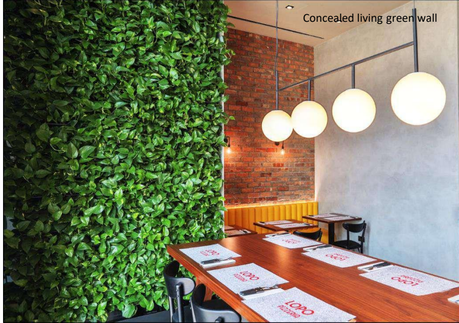
Concealed living green wall