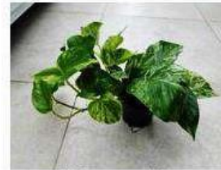
Epipremnum marble queen