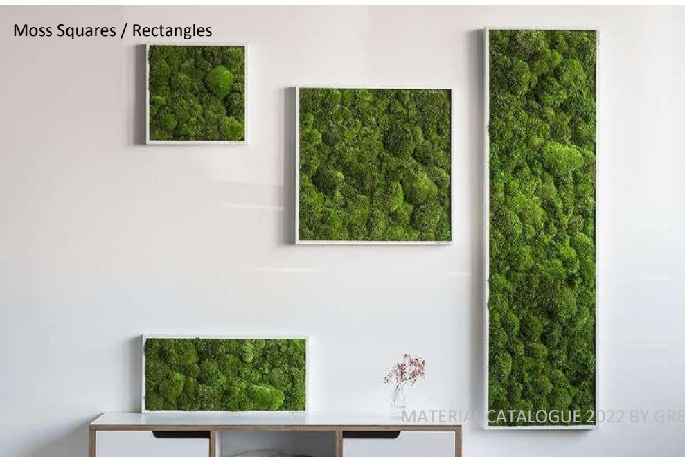
Moss Squares / Rectangles