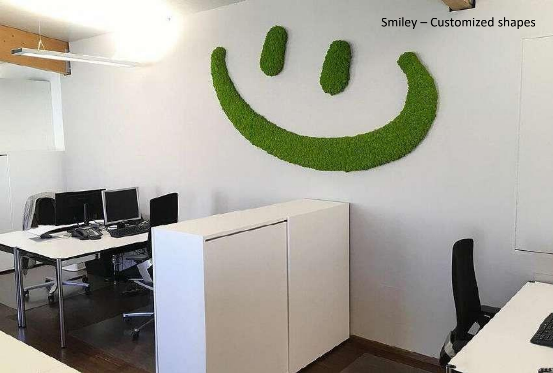
Smiley – Customized shapes