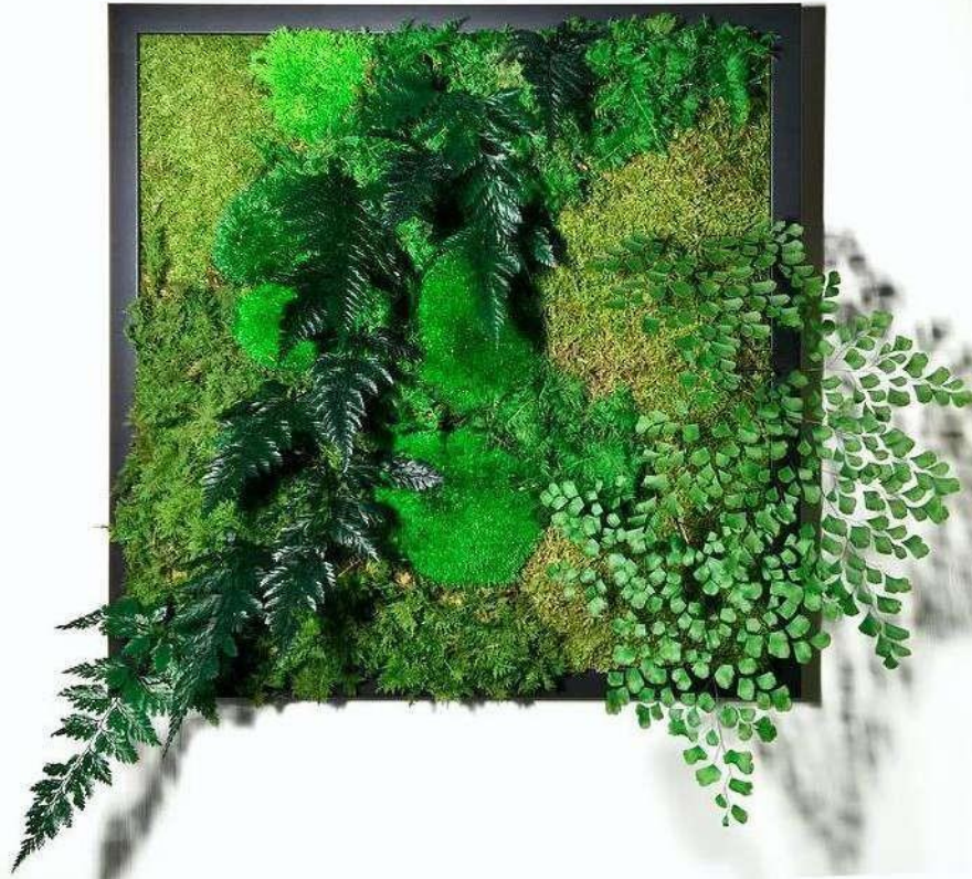
Foliage – Plant Island