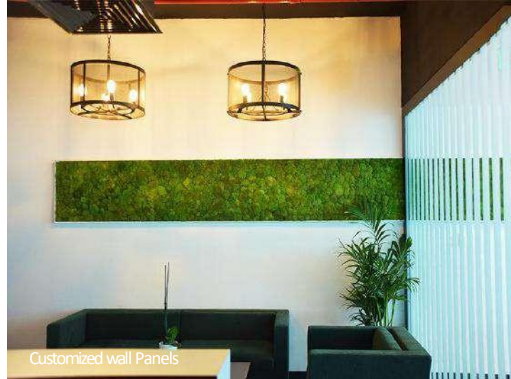
Customized wall Panels