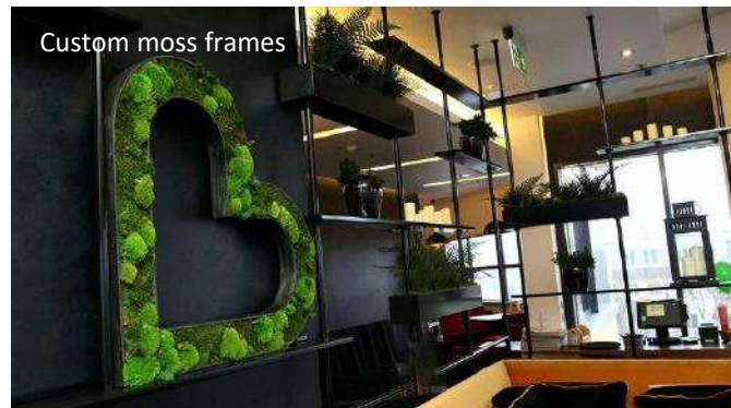
Custom moss frames