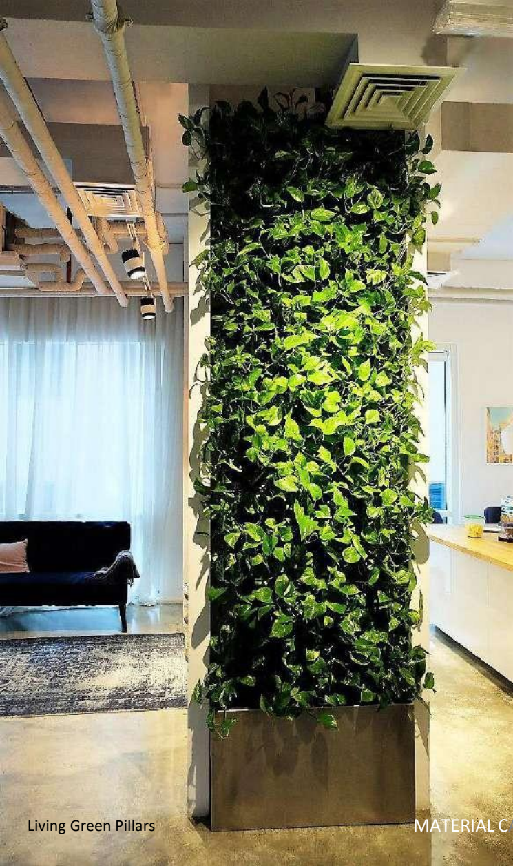
Living Green Pillars