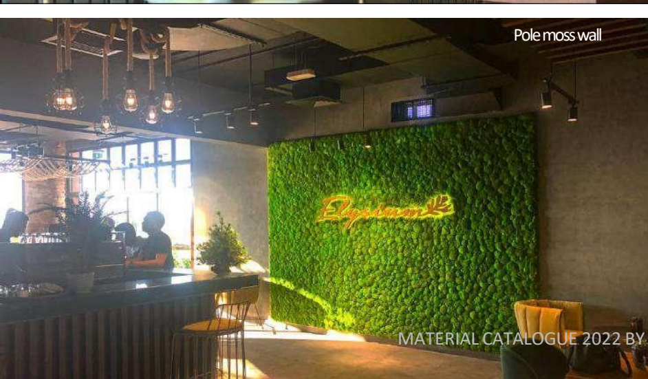
Pole moss wall