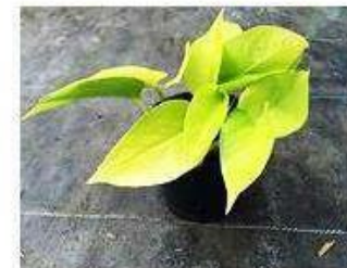
Epipremnum golden pothos