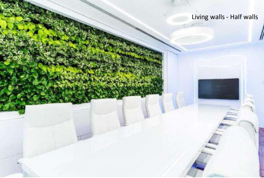
Living walls - Half walls