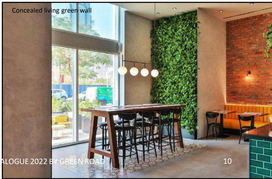
Concealed living green wall