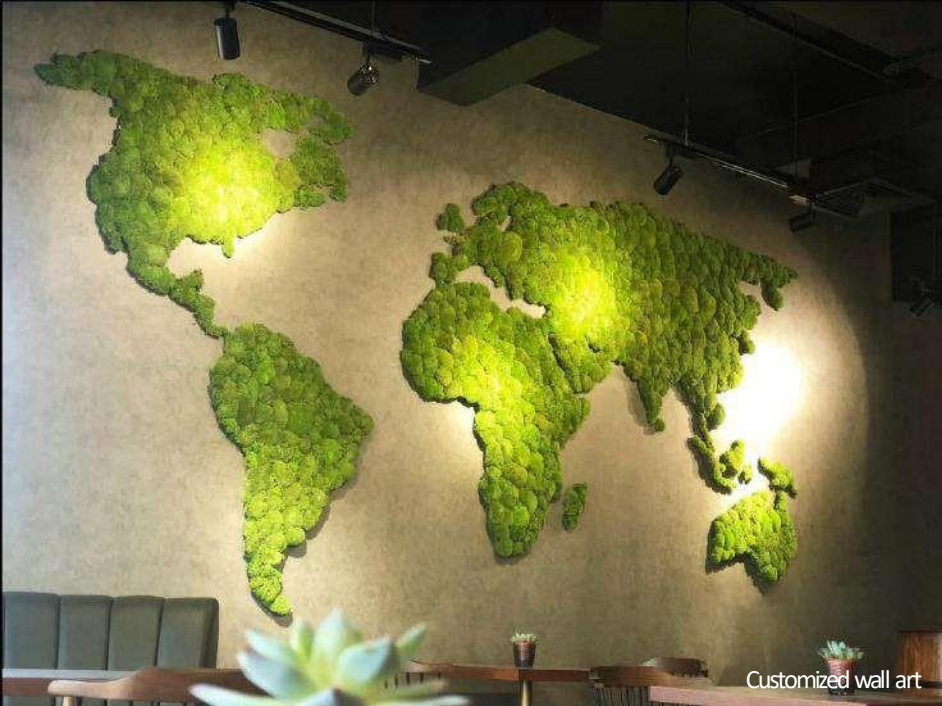
Customized wall art