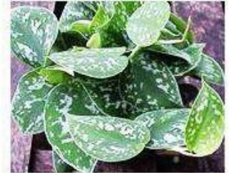
Scindapsus pictus argyraeus