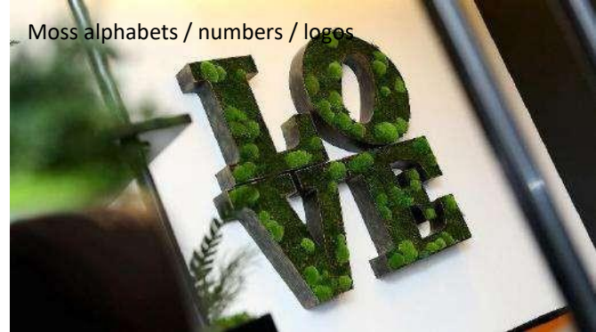
Moss alphabets / numbers / logos